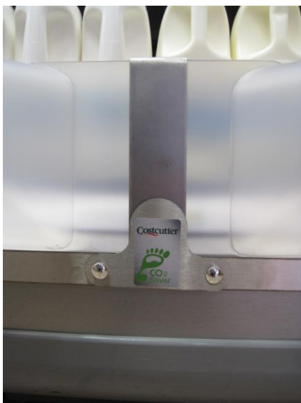
Retro-fit refrigeration scoops reduce consumption by ^10%