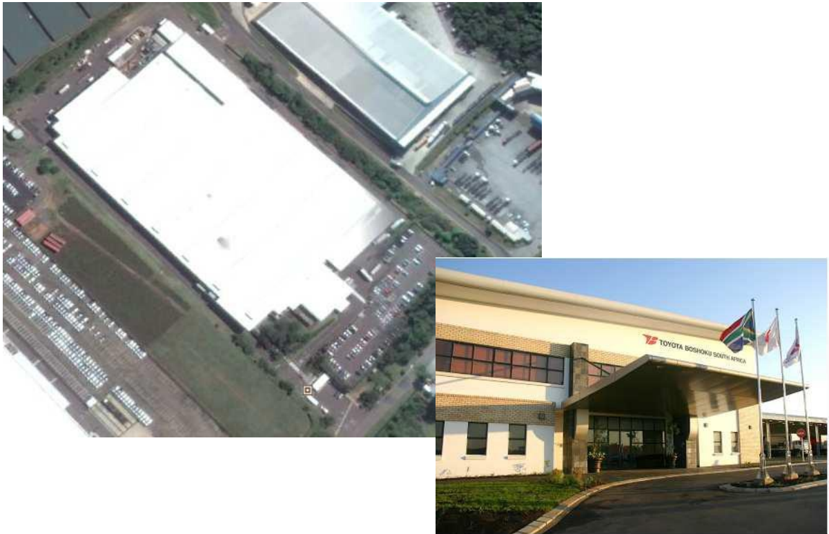
Figure 1: Location of Toyota Tsusho

Measurement and Verification (M&V) is the process of forecasting the savings and measuring the actual savings from energy management, energy conservation and/or energy efficiency projects.